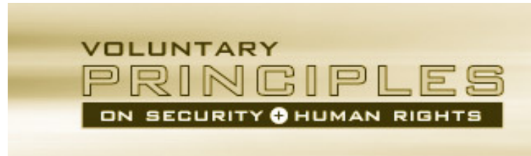
Voluntary Principles on Security and Human Rights